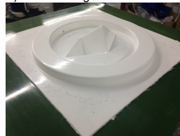
Figure 2: IMS gel-coated double tetrahedron moulding

Surface quality was monitored with a Gardner-BYK Wave-Scan Dual instrument. The parameters are dullness (<0.1 mm), shortwave (0.3-1.2 mm), longwave (1.2-12 mm) and distinctness of image (DOI Dorigon correlated to ASTM E430). A small number is indicative of better surface finish for the first three parameters while a high number (maximum 96) indicates a good surface for DOI.