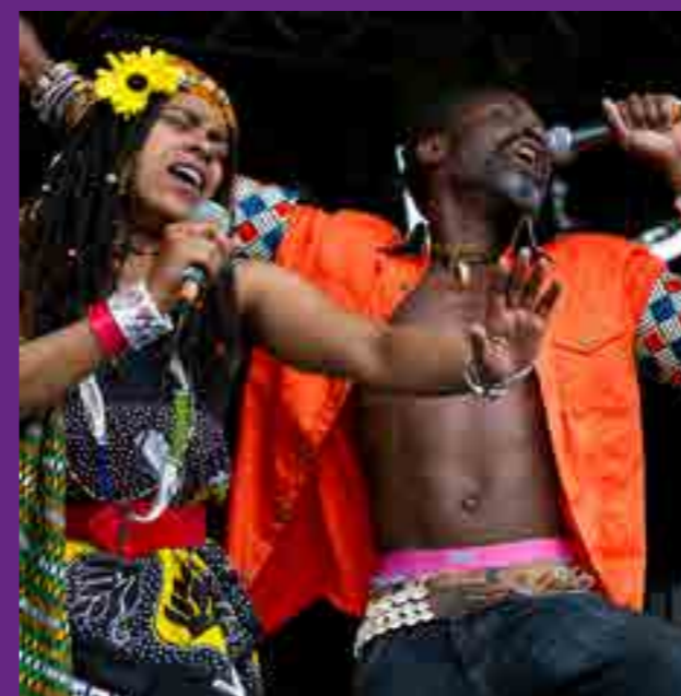
Yaaba Funk Hot Funk