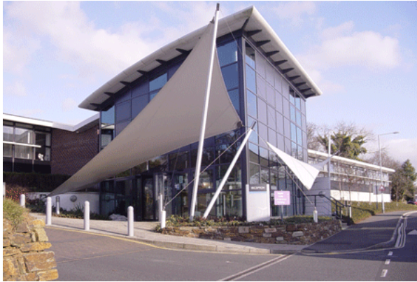
Tamar Science Park

FREEPHONE: 0800 015 3430 Email: swimsproject@pms.ac.uk www.pms.ac.uk/cnrg/swims